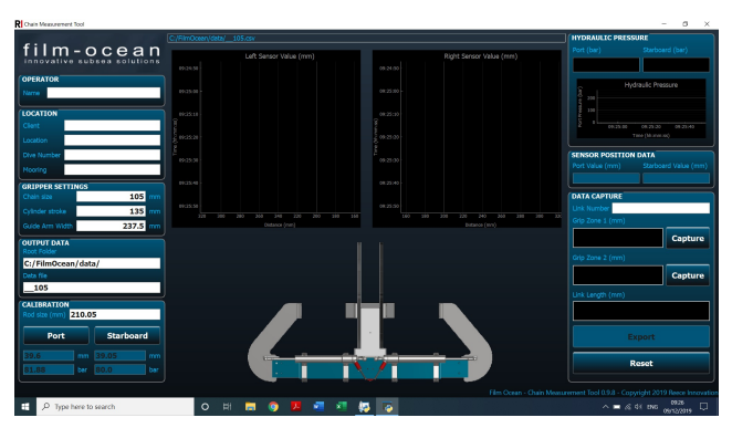
Measurements are recorded for Grip Zone 1 and Grip Zone 2 in the above illustration in Film-Ocean bespoke software package

Measurements are recorded using very accurate linear variable displacement transducers (LVDT). The hydraulic pressure of the individual cylinder used during each reading is also recorded to ensure the same force is being applied between the calibration and actual readings. All data output is displayed and recorded directly by bespoke software.